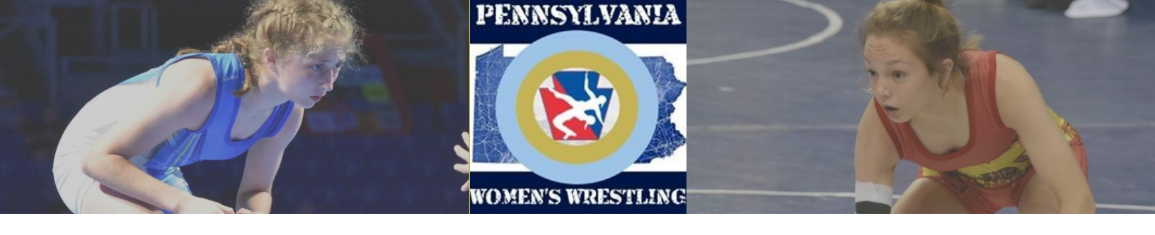
SUPER 32 Girls Freestyle Championships—North Carolina